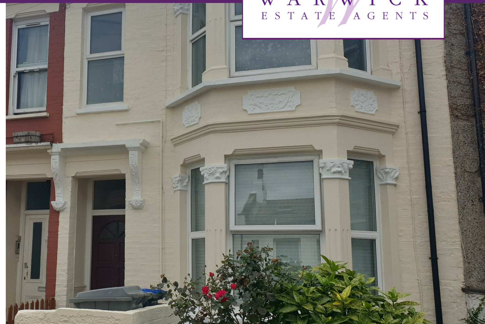
Inman Road, Harlesden, NW10 9JT